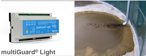
Alarm from slurry tanks