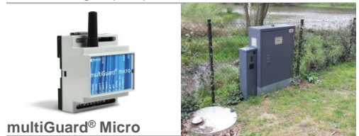
Monitoring of pump well levels