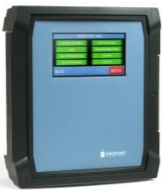
multiGuard® Max Profort no. 007025

A system for monitoring e.g. 4 cold rooms consists of: