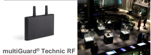
Climate monitoring of art and artifacts