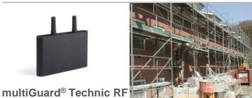
Monitoring of temperature and humidity in construction