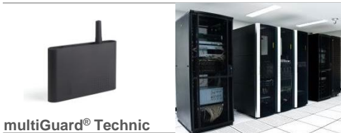
Monitoring of temperature and power in server rooms