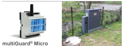
Monitoring of pump well levels