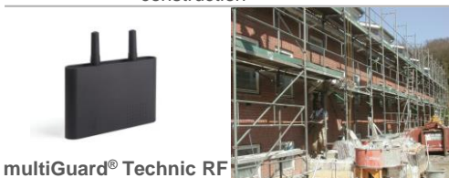
Monitoring of temperature and humidity in construction