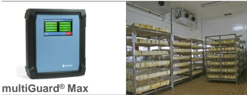
Monitoring of freezers and cold rooms