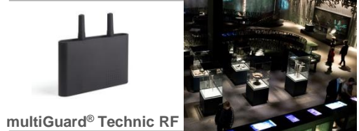
Climate monitoring of art and artifacts