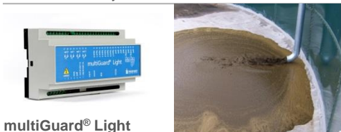
Alarm from slurry tanks